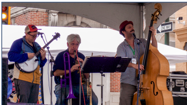
Queen City Porch Swingers at Staunton Jams FundRager 2023